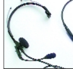
JMMN4066 Light Weight Headset with Boom Mic