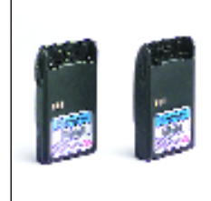
JMNN4023/4024 Slim & Hicap Li-Ion Batteries