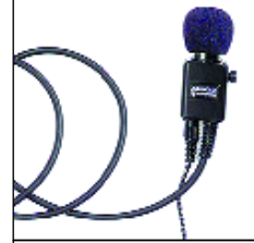
JMMN4062 Earpiece with Mic/PTT