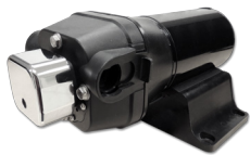
5.0 Water Pressure Pump